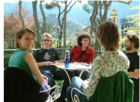
Summer School 2006