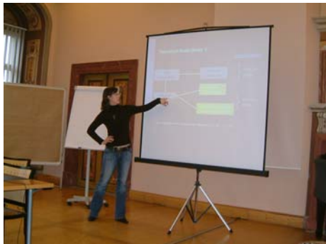
Consultation Seminar 2006